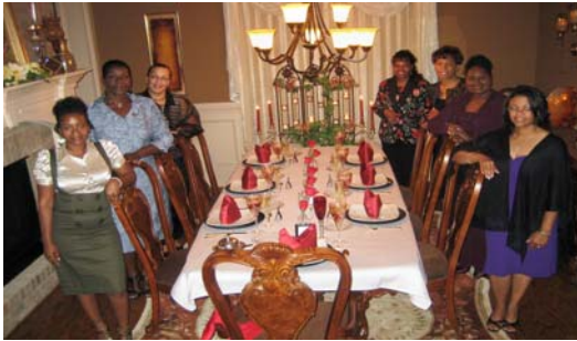
Formal Dinner — July 2008