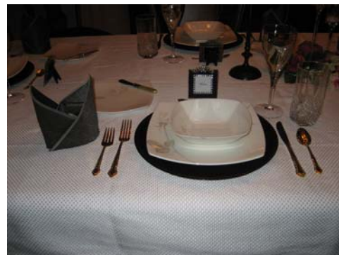
The Table Principle