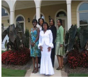
The first participants in the Titus 2 Residential Program, August 2007