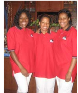
Extra Mile Servers