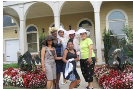
Afternoon Tea Hats & Accessories