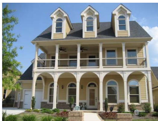
The Chateau de Repos et Benediction

“Go Ye...” Ministries Worldwide, Inc. launched the Titus 2 Residential Program for Women in Atlanta, Georgia in August 2007. The program is held at the Chateau de Repos et Benediction , which means house of blessings and rest .