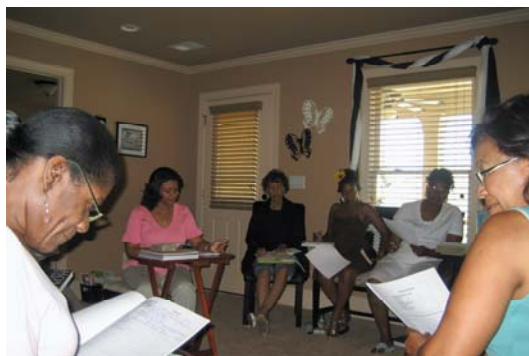
The Also Principle